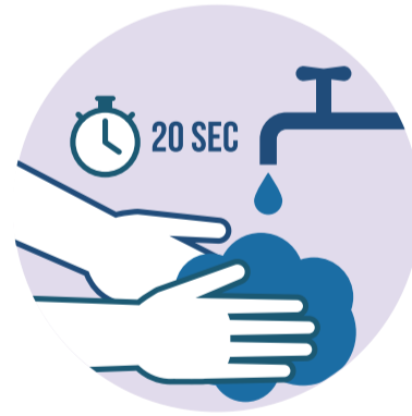
WASH HANDS WITH WATER AND SOAP OR USE SANITISER