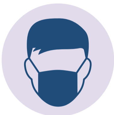
WEAR A FACE COVERING

Please remember to practise the following: